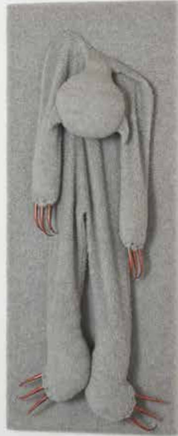
Permindar Kaur Sloth 2011